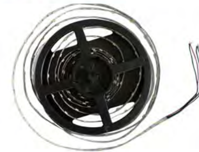
GN - FSP-5050UWC-150--B