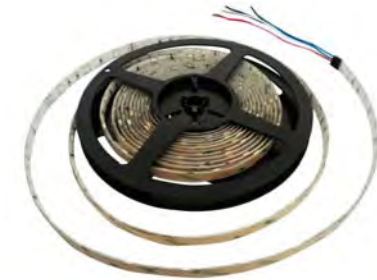
GN - FSP-1210UWC-150- WP- A