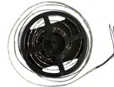
GN - FSP-1210UWC-150--A