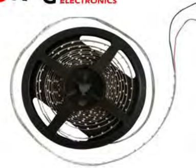
GN - FSP-1210UWC-300--A