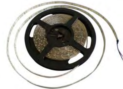
GN - FSP-1210UWC-600- WP-A