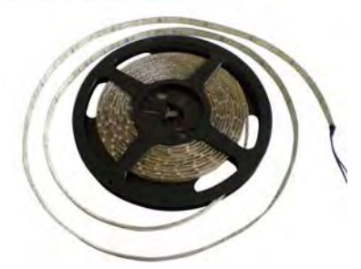
GN - FSP-1210UWC-600--A