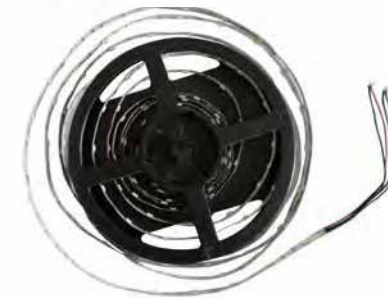
GN - FSP-5050UWC-300--A