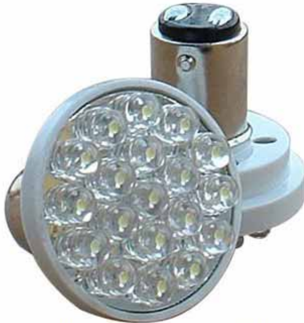
19 large view angle super brighter LED